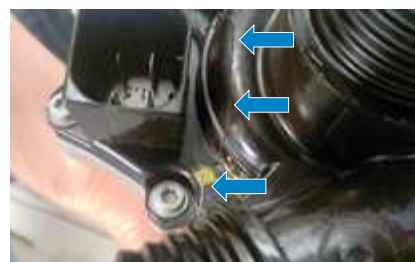
Potential issue with the series pump: plastic housing can fracture.

All content including pictures and diagrams is subject to change. For assignment and replacement, refer to the current catalogues or systems based on TecAlliance.