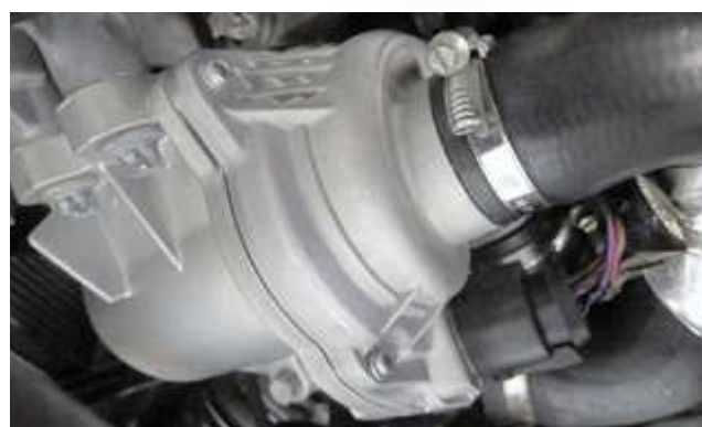
Installed in the vehicle